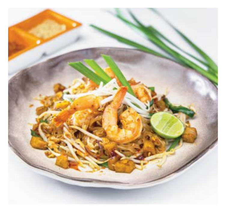
Pad Thai Goong Sod § Stir-fried rice noodles with prawns, egg and tamarind sauce