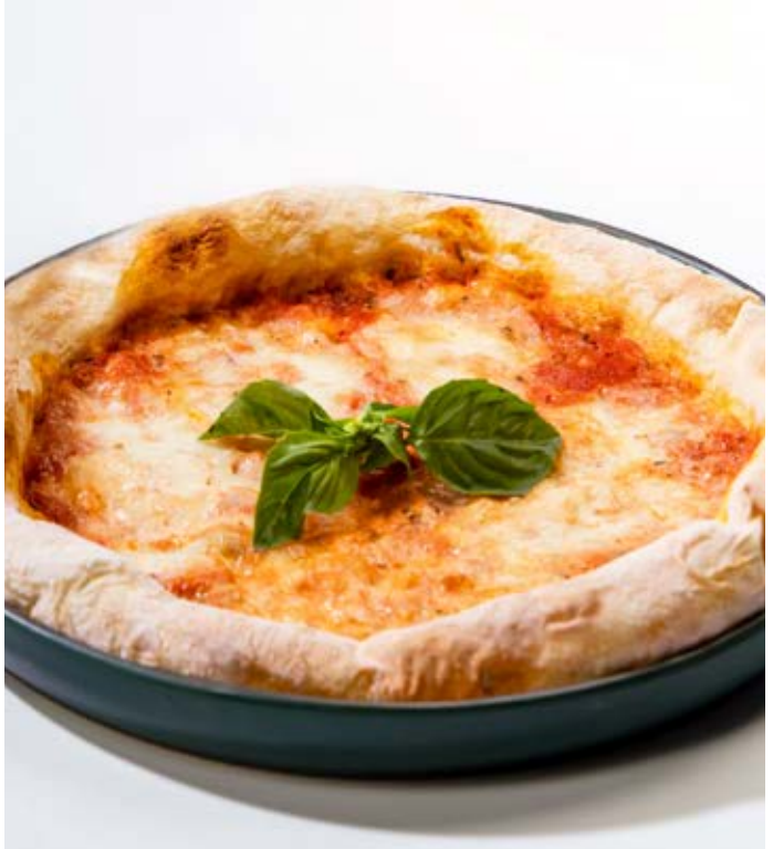
Margarita ü Tomato, mozzarella cheese and Italian basil