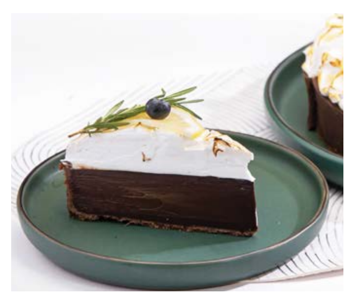
Lemon Dark Chocolate Meringue