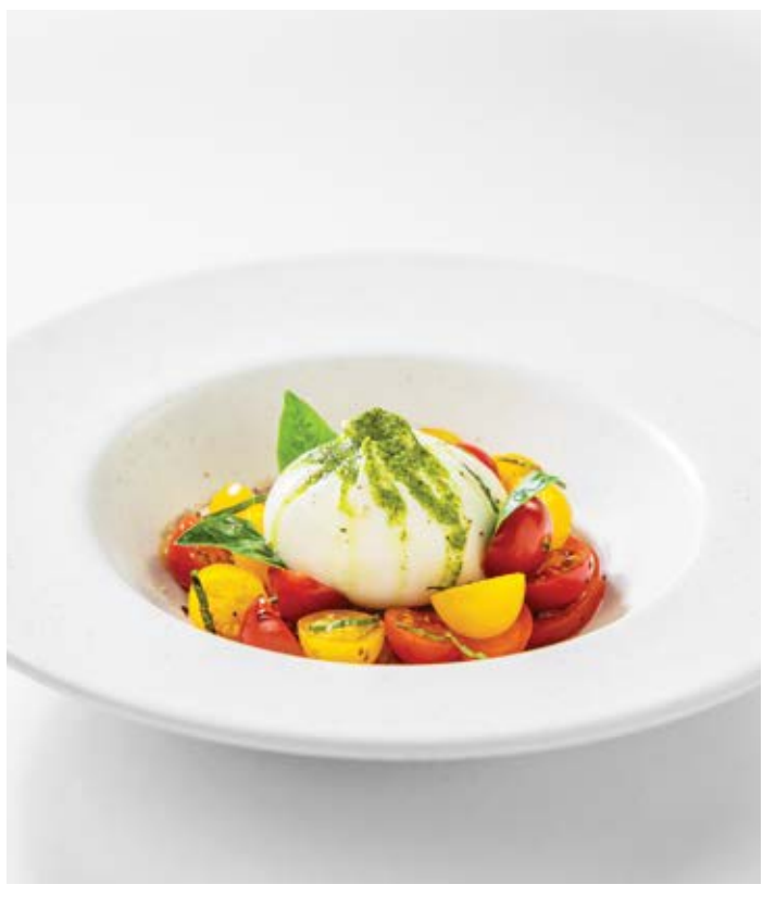
Burrata and Tomato Salad @ Burrata cheese, cherry tomatoes, Italian basil with pesto and balsamic