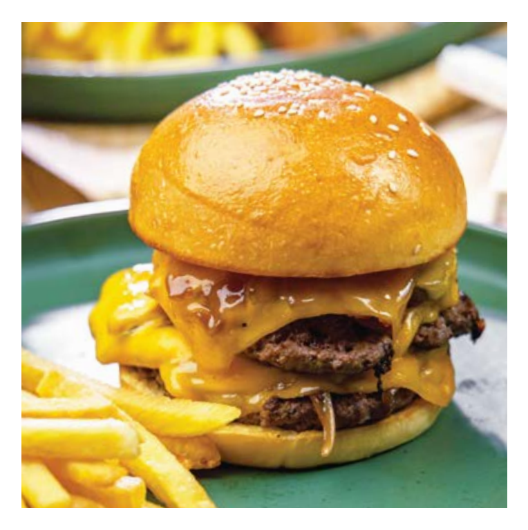
The Grand Burger @ Double Australian beef patty, brioche bun, bacon, caramelized onion, dill pickles, and melting american cheddar cheese