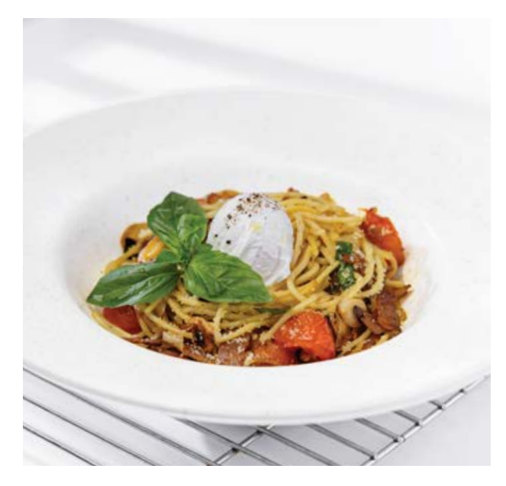
Chef's "aglio e olio" Spaghetti • THB 360 Bacon, garlic, dried chilli, tomato, basil, poched egg and parmesan cheese