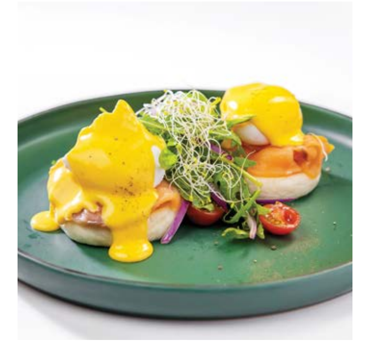
THB 320 Egg Benedict @ Smoked salmon, poached eggs, english muffin, fresh spinach, hollandaise sauce

grilled tomato, sautéed spinach, mushroom, hash brown potatoes