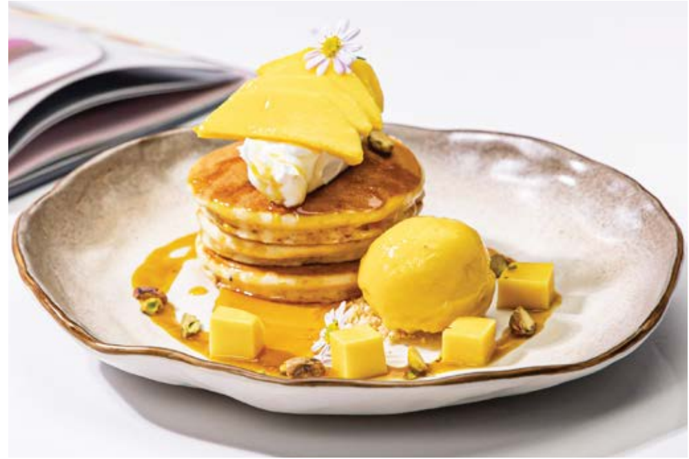
Chou Chou § Mango Pancake Mango sorbet, Sweet mango and maple mango syrup