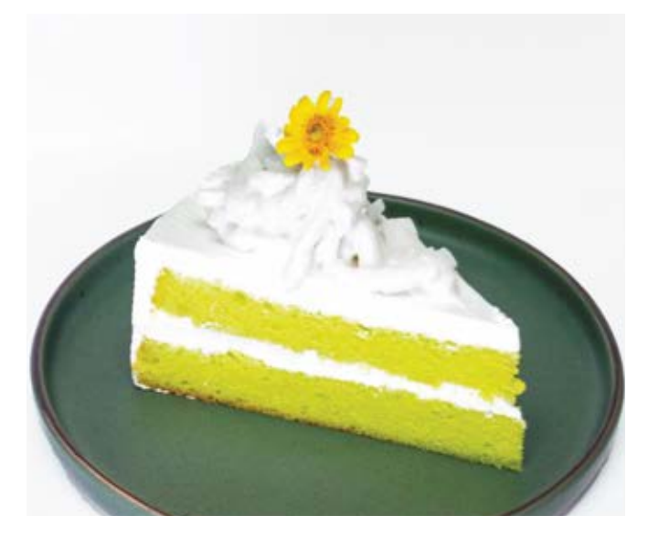
Coconut Pandan @