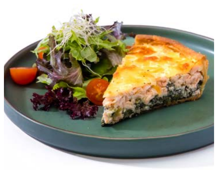
Salmon Quiche Salmon, spinach, mozzarella and parmesan cheese