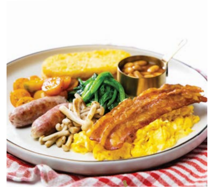
Chou Chou Classic Breakfast THB 420 Egg of your choice - Poched, Sunny side up, Scrambled or Omelet With pork *** sausage, crispy bacon, baked bean \{\mathbf{s}},

grilled tomato, sautéed spinach, mushroom, hash brown potatoes