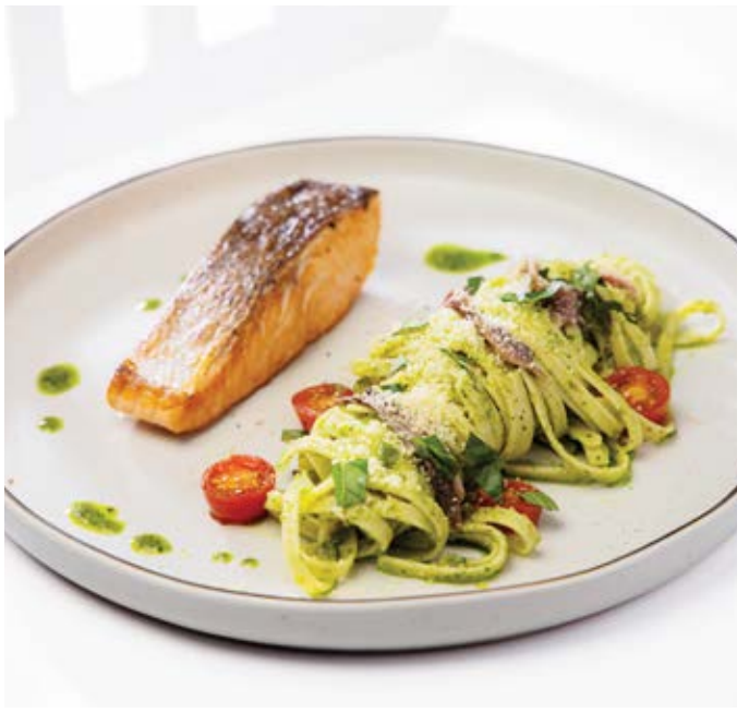
Salmon Fettuccine Pesto Grilled salmon with fettuccine and pesto sauce