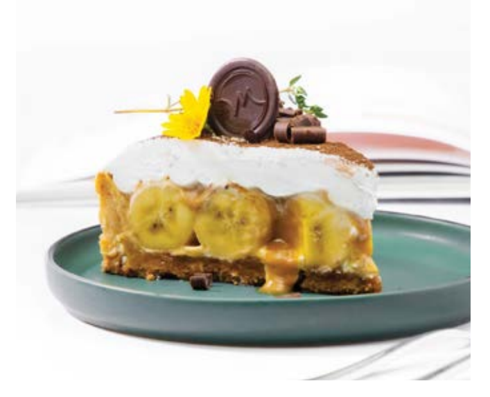
Banoffee Pie 🐠