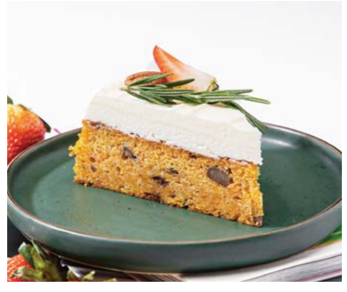
Pecan Carrot Cake