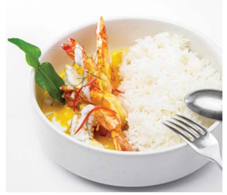
Chu Chee Goong Prawns in Thai red curry, coconut sauce served with steamed rice