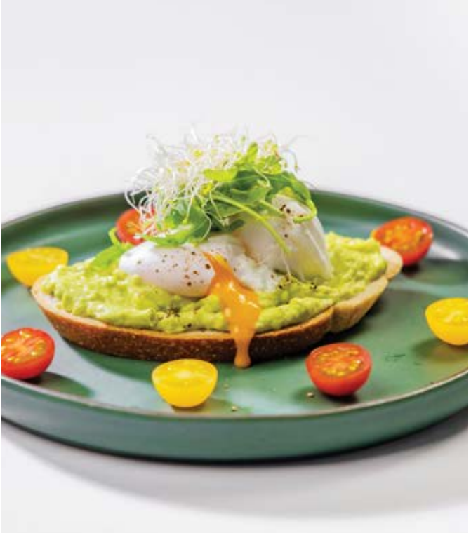
Avocado Egg Benedict Poached eggs, sourdough, avocado, tomato and rocket