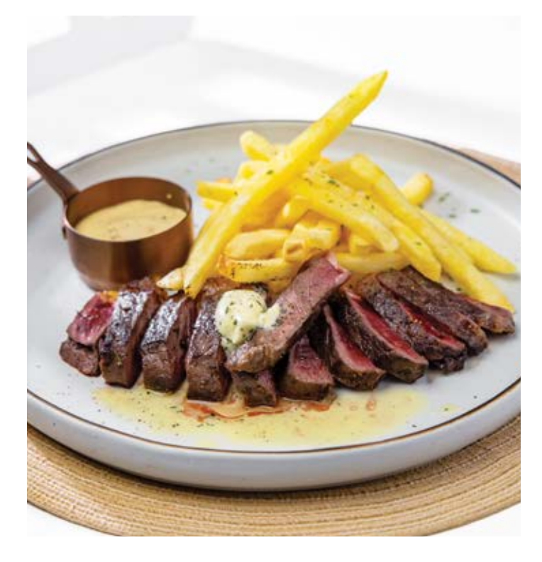
Steak Fries Beef Juicy beef striploin steak with mustard garlic aioli