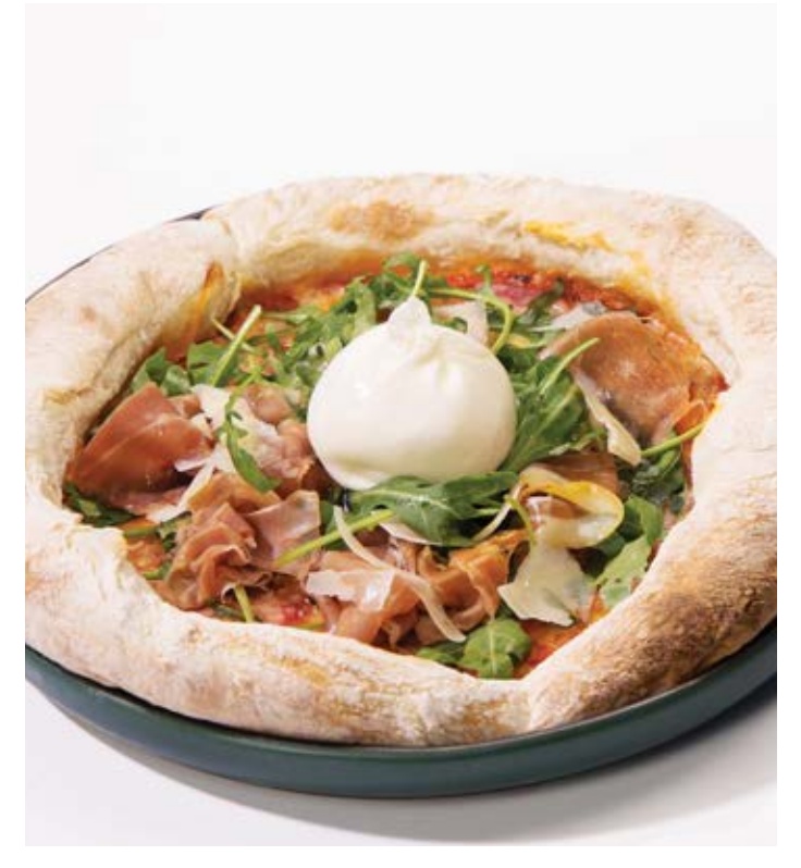
Salami & Prosciutto Pizza 🕶 🚳 Burrata cheese, mozzarella cheese, rocket salad and parmesan cheese